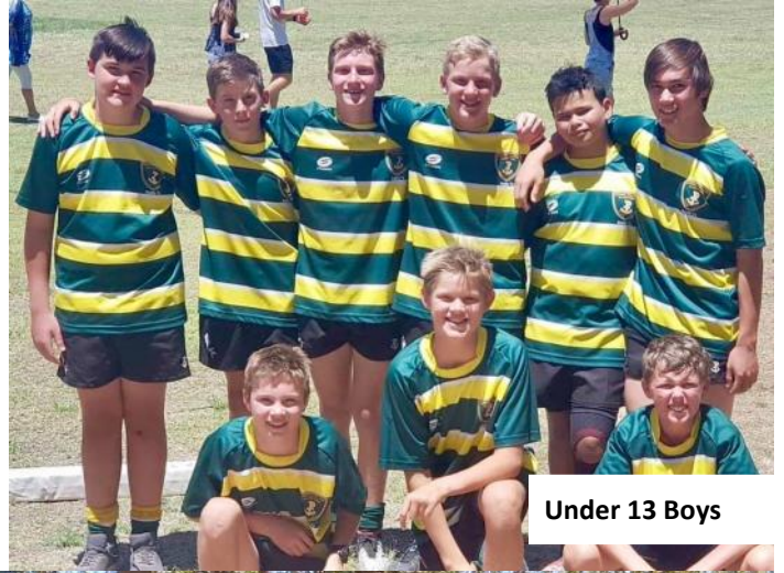
Under 13 Boys